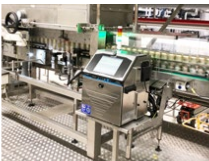
The twin nozzle printer has two nozzles per print head and encodes up to 45,000 cans per hour.

“The Hitachi printer was able to meet the high demands on coding quality and reliable availability of the marking system.”